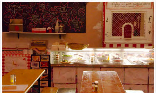
Courtesy of Derrière , Paris and Momo and Sketch , London. Photo Pavlos Metaxas © The Museum of Everything

Unique to the Paris show, The Café of Everything is a tasty pop-up resto created by the team behind London's Momo and Sketch . Working with their Parisian establishment Derrière , they have adapted their menu for a French audience and are open for late lunches and early dinners.