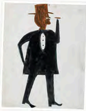
Left: Charles August Albert Detischau, untitled, 1910/20 © The Museum of Everything Right: Bill Taylor, untitled, c 1937/42. © The Museum of Everything