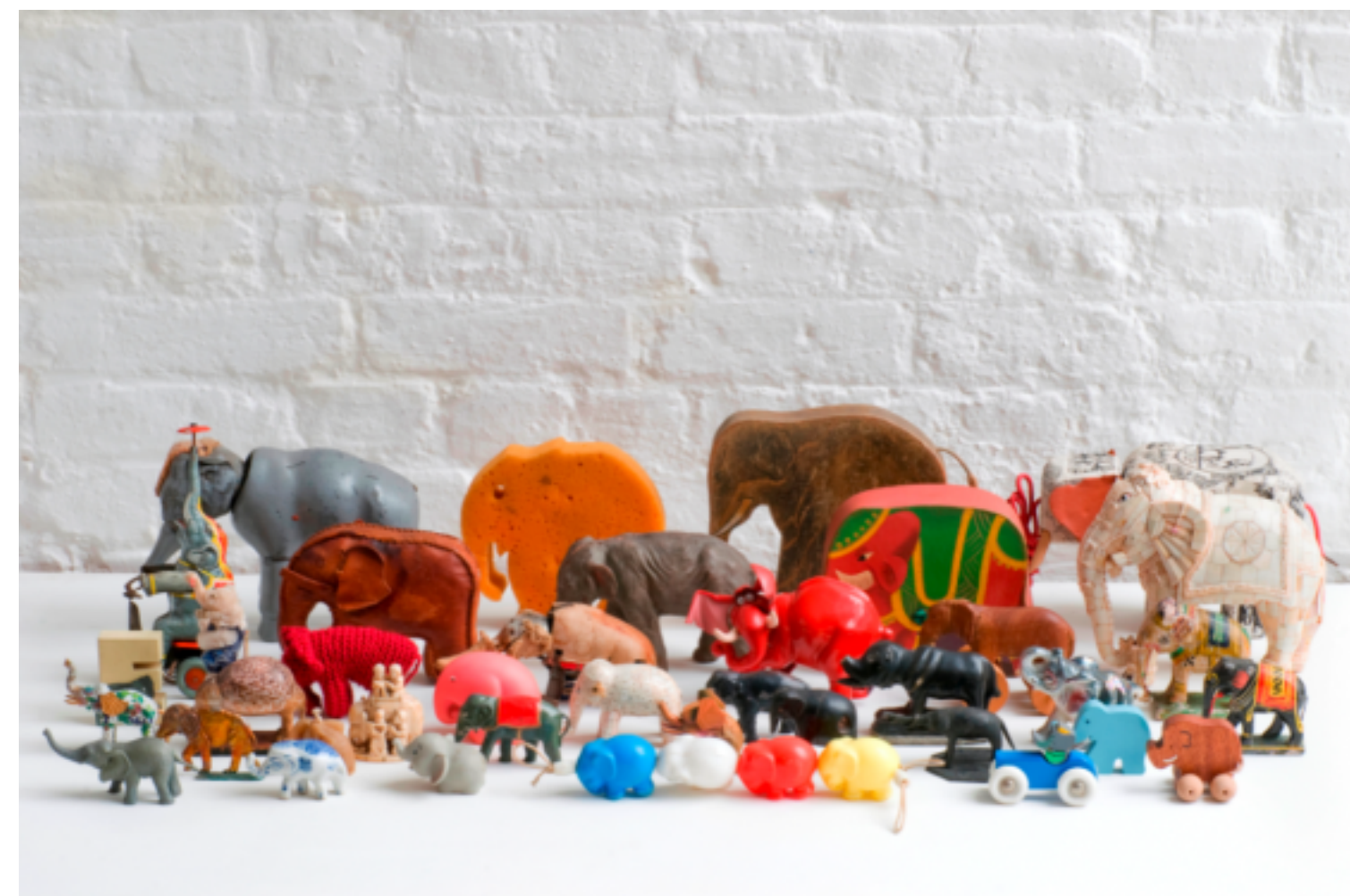
Elephant group c 1920/70