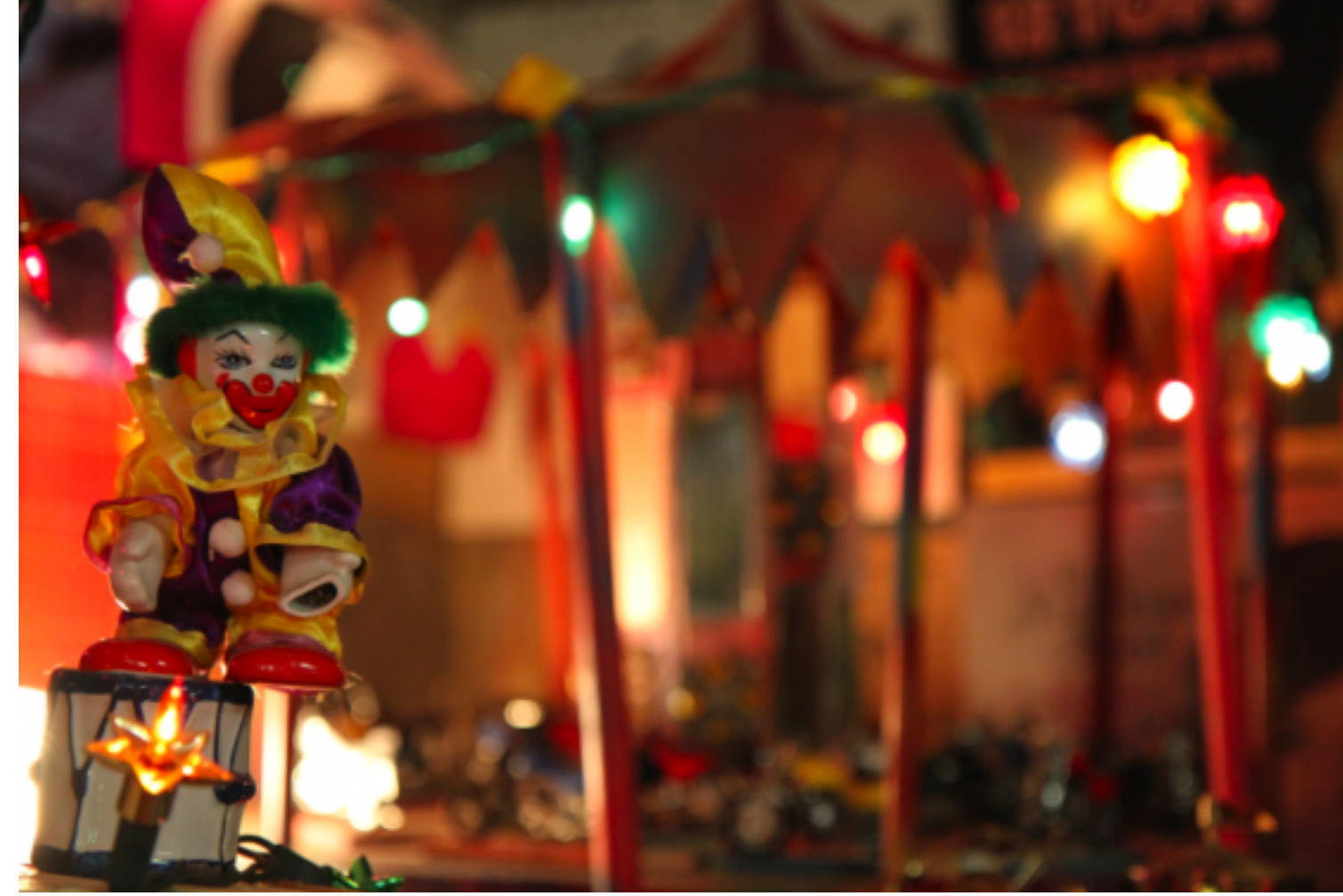
Arthur Windley's handmade fairgrounds, 2010, courtesy of the Museum of Everything.

Sir Peter Blake, known as the father of British Pop Art, will outdo himself again with The Museum of Everything's Exhibition #3, which will be on display starting Frieze Week – October 13 th – through late December. Located on the corner of Regents Park Road and Sharpleshall Street in London, the Museum is known for displaying art created by the unknown. Non-traditional art, marginal art, folk art, outsider art, art brut, whatever you want to call it, the Museum of Everything is the place to see it. Earlier exhibitions were extremely popular, especially Exhibition #1, which had 35,000 visitors. Featuring drawings, paintings, and statues, but also murals, machines, and essays, Exhibition #1 was voted by Time Out and Art Forum as Best of 2009.