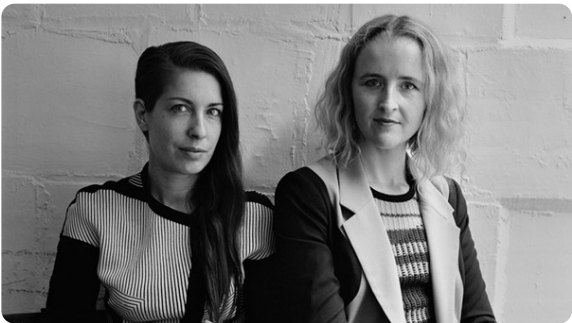
Meet New York label Ohne Titel