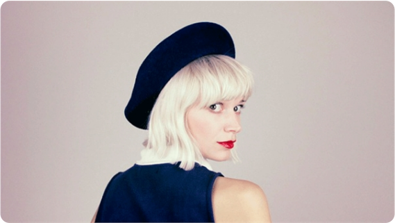
The Mad Hatter