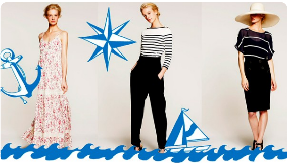
Summer of Somerset