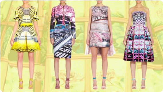
Mary Katrantzou launches e-commerce site