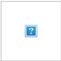
DuWop Lip Venom 2nd Sin £25.00