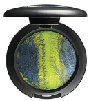
MAC Mineralize Eye Shadow £17