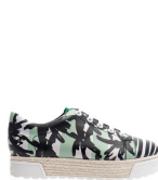
Palm and stripe-print platform trainers £167

SHARE THIS POST: Tweet +1 Pin it Send Like 1.8k