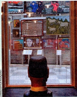
The Museum of Everything

Supported by creators across the arts, from David Byrne and Nick Cave to Grayson Perry and Edward Ruscha, the only theme