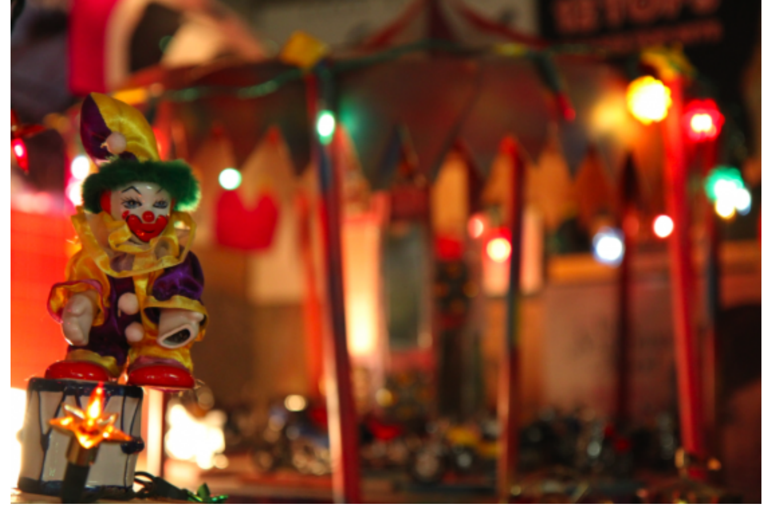
Arthur Windley's handmade fairgrounds, 2010, courtesy of the Museum of Everything.

Sir Peter Blake, known as the father of British Pop Art, will outdo himself again with The Museum of Everything's Exhibition #3, which will be on display starting Frieze Week – October 13<sup>th</sup> – through late December. Located on the corner of Regents Park Road and Sharpleshall Street in London, the Museum is known for displaying art created by the unknown. Non-traditional art, marginal art, folk art, outsider art, art brut, whatever you want to call it, the Museum of Everything is the place to see it. Earlier exhibitions were extremely popular, especially Exhibition #1, which had 35,000 visitors. Featuring drawings, paintings, and statues, but also murals, machines, and essays, Exhibition #1 was voted by Time Out and Art Forum as Best of 2009.