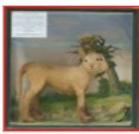
Walter Potter Self-taught craftsman whose extraordinary Museum of Curiosities became widely known as an icon of Victorian whimsy.