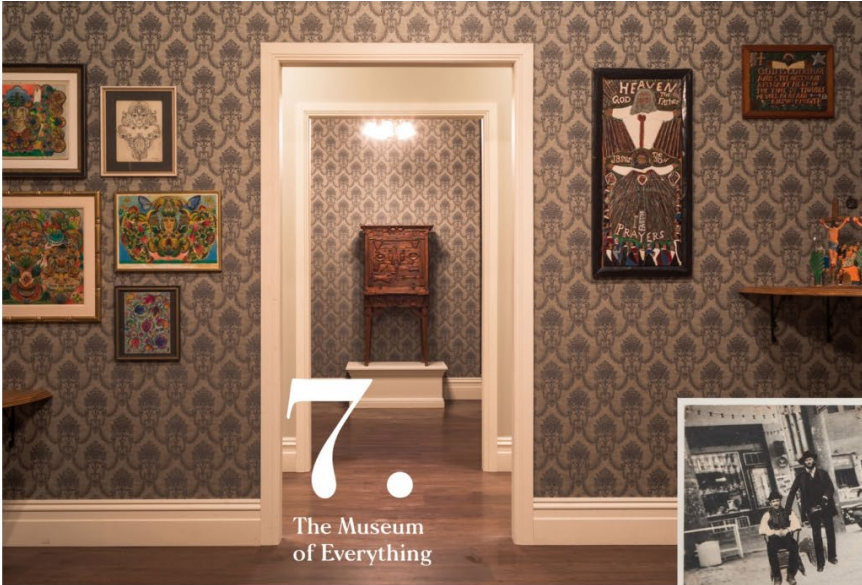
The Museum of Everything