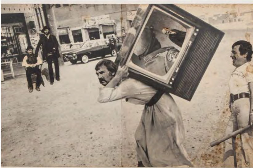
PHOTO: The work of Romanian artist Ion Birlădeanu is also featured at MONA. (Supplied: The Museum of Everything)

Mr Brett said The Museum of Everything hoped to uncover new Australian artists following the MONA exhibition.