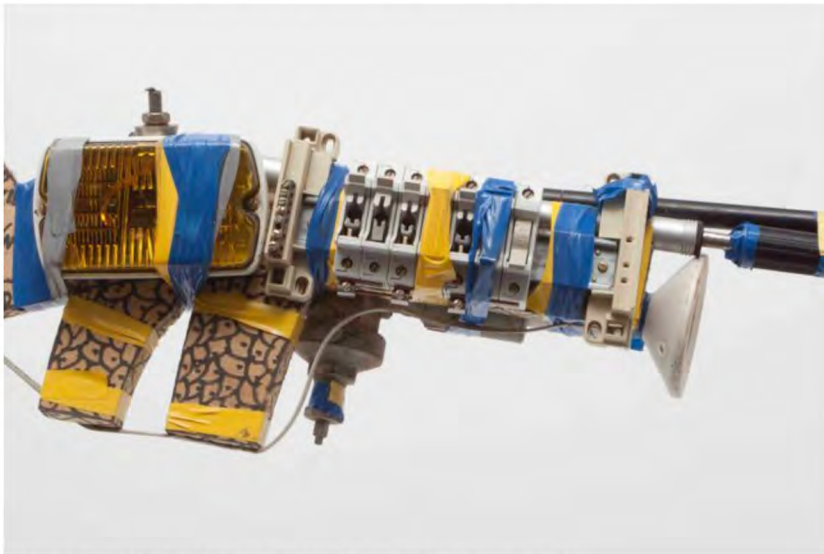
PHOTO: An untitled artwork from The Museum of Everything. (Supplied: MONA)

"What we hope is that that actually gives a legacy to Australia where the big museums start taking note that there is another contemporary art lurking under the surface of the mainstream."